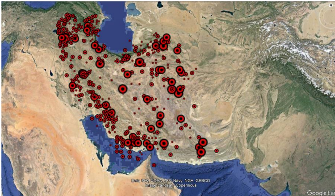
Figure 1: Recorded earthquakes 1900-1963